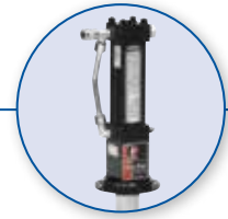
Hydraulic Dyna-Star Pump – 2000