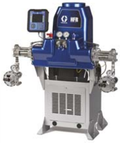
HFR™ Metering System