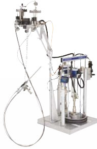
ExactaBlend™ AGP Advanced Glazing Proportioner