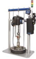
D200 Ambient Supply System