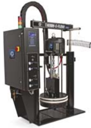
Therm-O-Flow™ 200 Hot Melt System