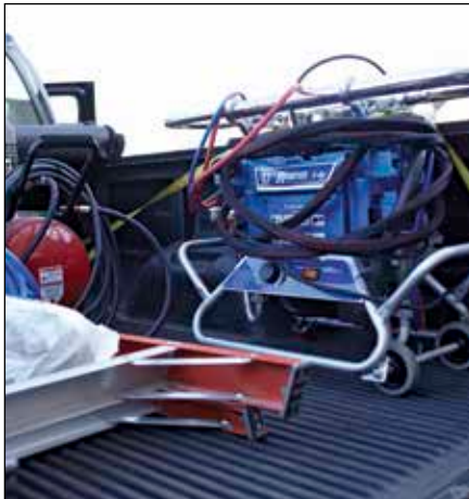
Ready - Easy to transport to the job site.

* Per The Dow Chemical Company for Froth Kits: The theoretical yield has become an industry standard for identifying certain sizes of two-component kits. Theoretical yield calculations are done in perfect laboratory conditions, without taking into account the loss of blowing agent or the variation in application methods and types. This chart is an example only and should be reviewed for each application. Dollar savings are not guaranteed. Actual results may vary.