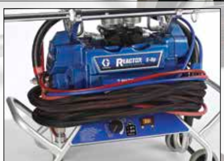
Carrying Handle/Hose Wrap Easy to transport, convenient hose storage.

Easy to maneuver – 70% lighter than standard Reactor heated hose