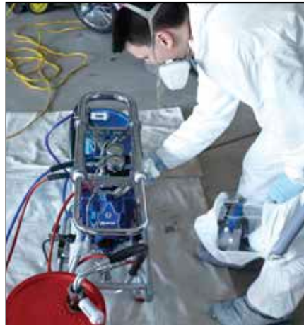
Set - Get ready to spray in a matter of minutes.