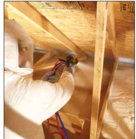
Spray - Ideal for attics and rim joists.