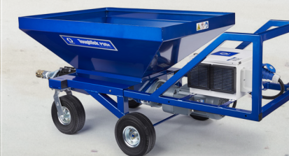
ROTOR STATOR PUMP

The simple technology of a rotor stator pump is perfect for contractors who are looking for a basic pump that is easy to clean and service. The P30X has a large 60-gallon (227 L) hopper and offers superior performance from a rotor stator pump.