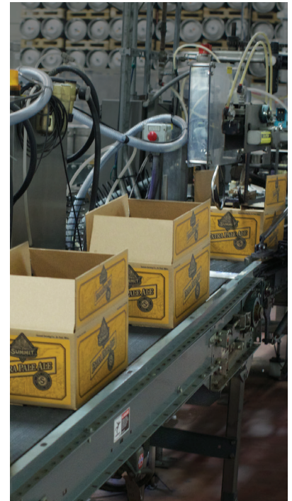
Charred hot melt adhesive causes nozzle plugging, leading to downtime on the packaging line.

Charring: Tank systems maintain large volumes of molten adhesives for hours or days. This long heat soak leads to glue charring. Charring also happens when the level of molten glue is allowed to vary widely. The glue on the side walls, exposed to the atmosphere, chars very quickly. The charred material will cause plugging in nozzles, leading to downtime on the packaging line. This excessive charring can also lead to premature failure of fluid seals in pumps and guns.