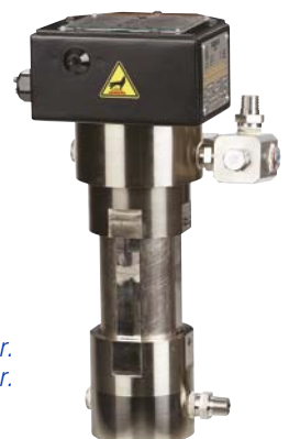
Externally controlled Viscon HF heater. Shown: non-explosive atmosphere heater.