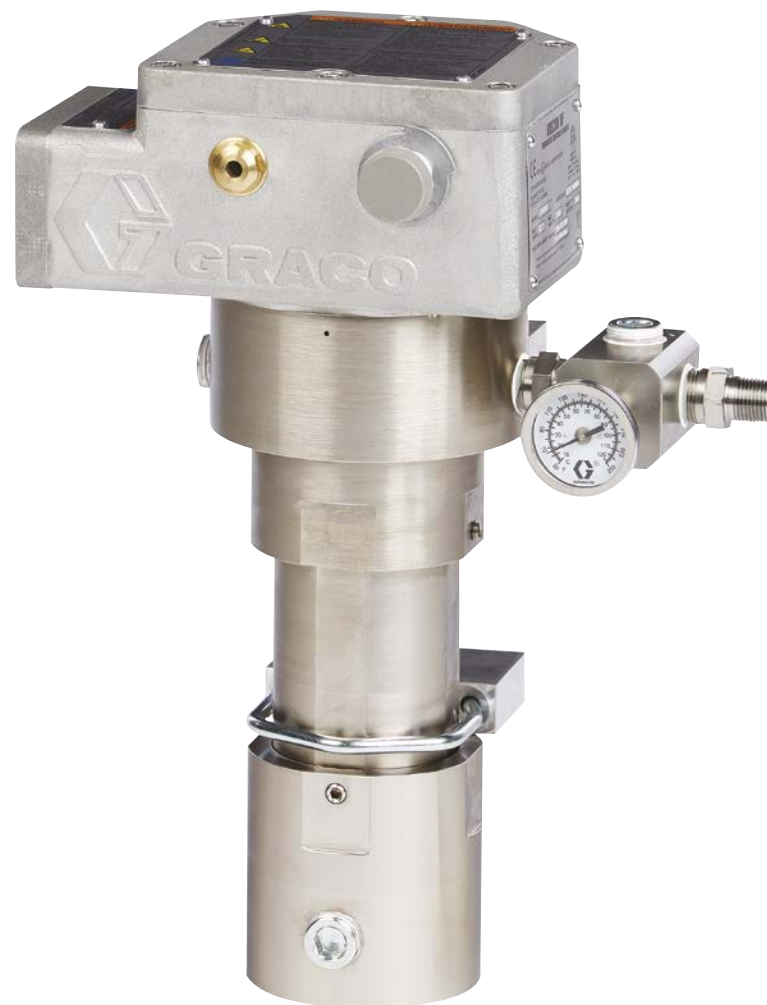
Complete Viscon HF heater with manual thermostat control. Shown: explosive atmosphere heater.