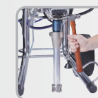
Loosen the Clamping Nut