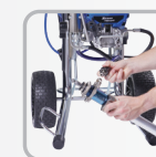
Remove Hose & Suction Tube