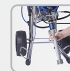
Open Door & Remove Pump