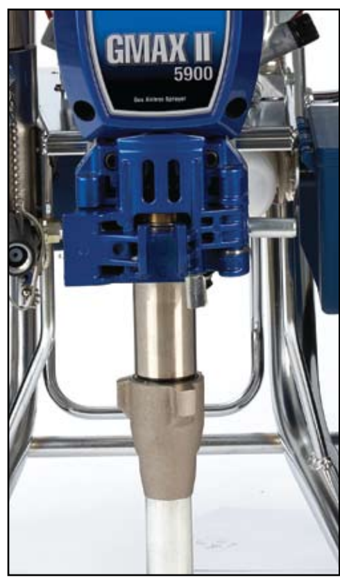
You can find the exclusive ProConnect System on these Graco sprayers!