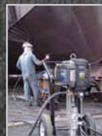
If you use this...

Same “at the tip” performance as the largest sprayers. Spray the same coatings, get the same results!