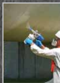
You NEED this!