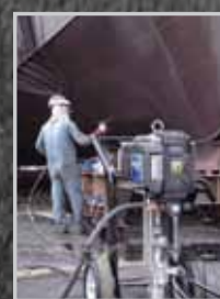
If you use this...

Same “at the tip” performance as the largest sprayers. Spray the same coatings, get the same results!