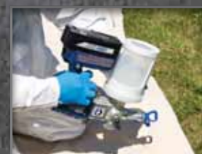
Attach cup with solvent, set to "Clean" and run upside down.