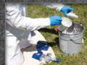
Dispose of cup liner and lid.