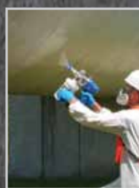
You NEED this!