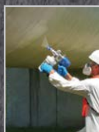
You NEED this!