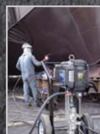
If you use this...

Same "at the tip" performance as the largest sprayers. Spray the same coatings, get the same results!