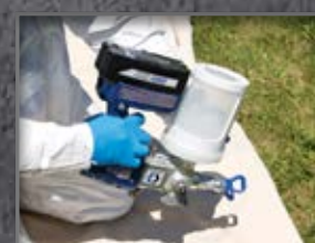
Attach cup with solvent, set to "Clean" and run upside down.