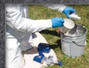
Dispose of cup liner and lid.