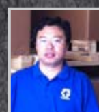
Chen Da Xinjiuming Painting Shenyang, China

"Now my touch-up matches my original spray finish, and not to mention that it's a lot cleaner and faster than my roller."