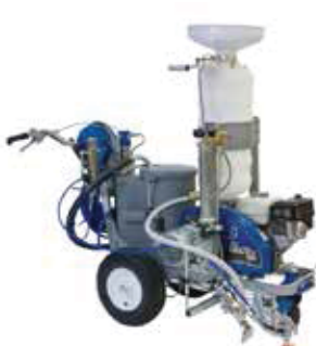
LineLazer IV 200hs Shown