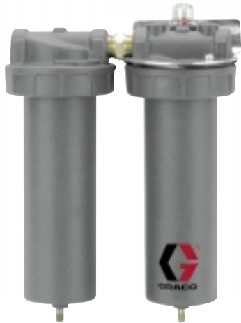
Model Number 234405

Remove Water, Oil & Contaminants from Compressed Air