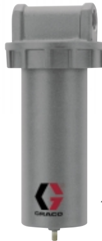
Model Number 234408