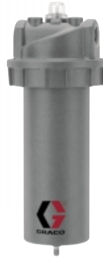
Model Number 234409