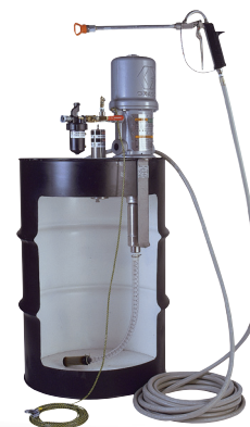
Hydra-Clean Air-Operated 10:1 Drum-Mount