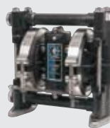
Husky™ 307 3/8 inch Pump