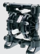
Husky 515 1/2 inch Pump