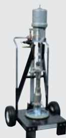
President® 10:1 450 Cart Mount