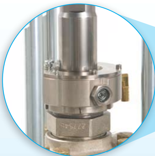
Sealed Wet Cup

Long-Lasting Piston Pumps with Sealed Wet Cup