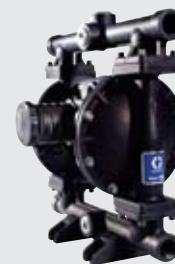
Husky 1050 1 inch Pump Family