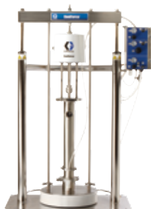
SaniForce 5:1 Drum Unloader