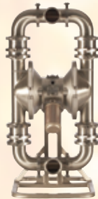
SaniForce 3150 HS 76 mm (3 in)