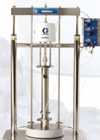
SaniForce 5:1 Drum Unloader