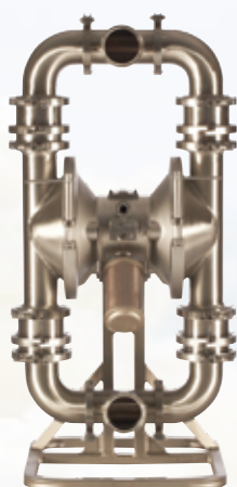
SaniForce 3150 HS

SA33A1 Saniforce 3150 HS - 76,2 mm (3 in) inlet/outlet with PTFE balls and EPDM/PTFE overmolded diaphragms