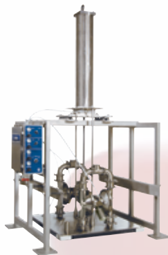
SaniForce 3150 BES