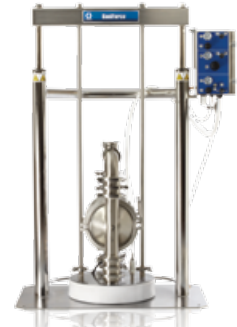
SaniForce 3150 HS Drum Unloader