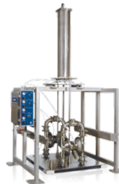
SaniForce 3150 BES

All written and visual data contained in this document are based on the latest product information available at the time of publication. Graco reserves the right to make changes at any time without notice.