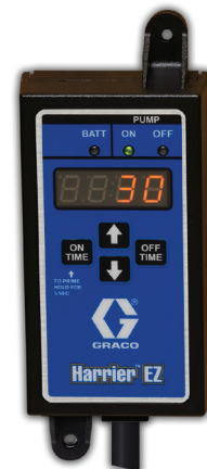
Harrier EZ and Harrier Controllers