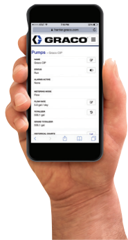
Monitor your Harrier+ controller right from your cell phone!