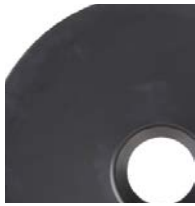
200 l (55 gal)