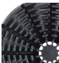
20 l (5 gal)