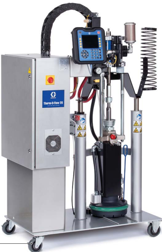
Therm-O-Flow 20 (5 gal)