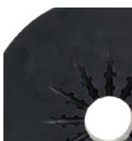
20 l (5 gal)