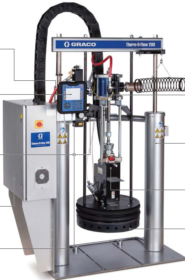
Therm-O-Flow 200 (55 gal)

Easy-to-manoeuvre casters are sold as a kit for the 20 l (5 gallon) system