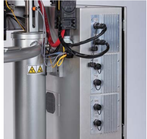
Six connection points for the 12 customer defined heat zones

Graco offers a complete line of Therm-O-Flow bulk hot melt systems and "point of use" melt systems – each can be configured to fit your specific application.