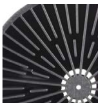
200 l (55 gal)