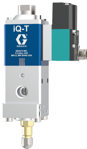
iQ-T Tip Seal

Three sealing options let you optimize your dispense based on your material and application