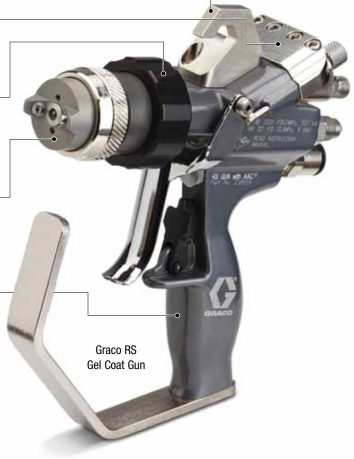
Graco RS Chop Guns and Graco RS Gel Coat Guns are both available in internal and external mix models