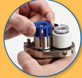
Replace with new blade cartridge