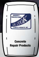
AW Cook Repair Mortar

A.W. Cook has a full line of vertical and horizontal repair mortars. Sherwin-Williams will help you select the right product for repair of existing brick and concrete manholes prior to receiving chemical coatings and to stop water infiltration and exfiltration.