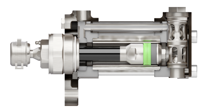
Cutaway of Z-Pump with Elite Construction