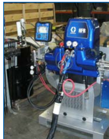
The Graco distributor, Foampak and Graco were able to provide newer technology at a lower price point.