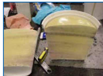
The gun and impingement mixing of the Graco HFR Metering System created perfect foam and cell structure with no voids or cracks.