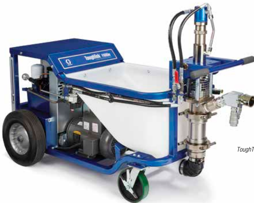
ToughTek F680e Fireproofing Pump

The ToughTek Fireproofing Pump's durable piston pump stands up to highly abrasive fireproofing materials. Its quick knockdown design makes maintenance fast and easy. You eliminate the frequent expense of replacing pump parts.