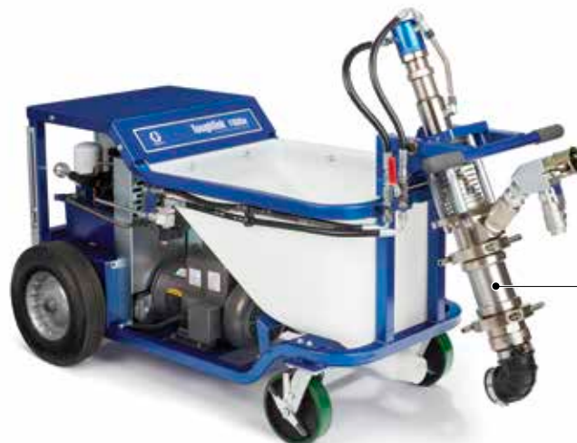
Pivoting Pump Lower