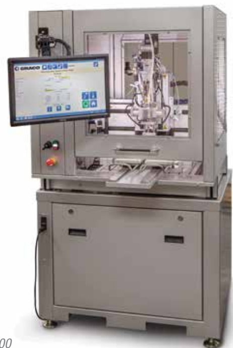
Graco UniXact C300