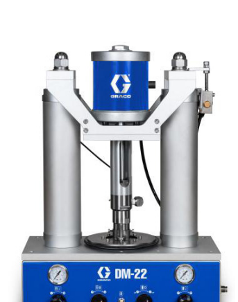
DynaMite 22 Supply System *Replacement for 25C843

Graco is a worldwide leader in fluid handling and is committed to providing A+ service every time. Visit graco.com to learn more about Graco's solutions for thermal dispensing and to speak with an expert about your process.