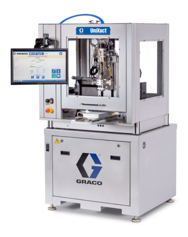
UniXact C300 Automation Table