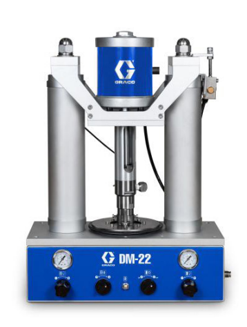
DynaMite 22 Supply System * Replacement for 25C843