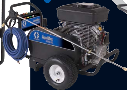
Cold Belt Drive