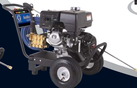
Cold Direct Drive