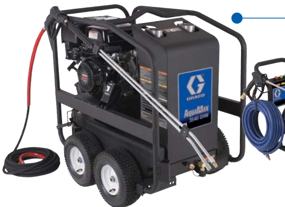
Hot Direct drive