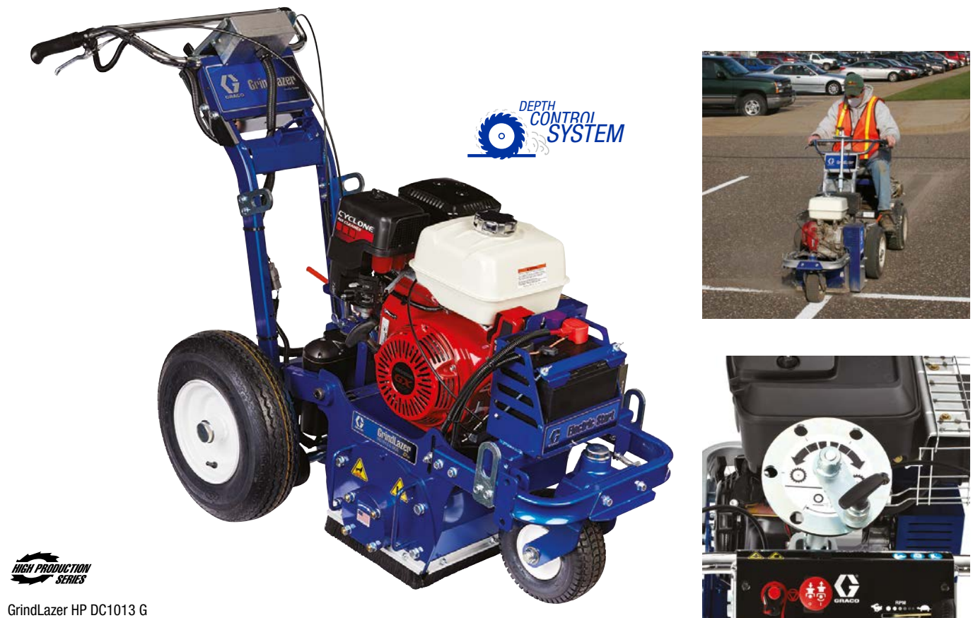
GrindLazer HP DC1013 G DCS (shown)