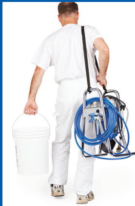
Includes Easy-to-Carry Shoulder Strap