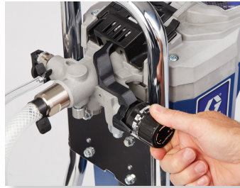
Adjustable Pressure Control

Patented power-piston pump for greater reliability and long life.