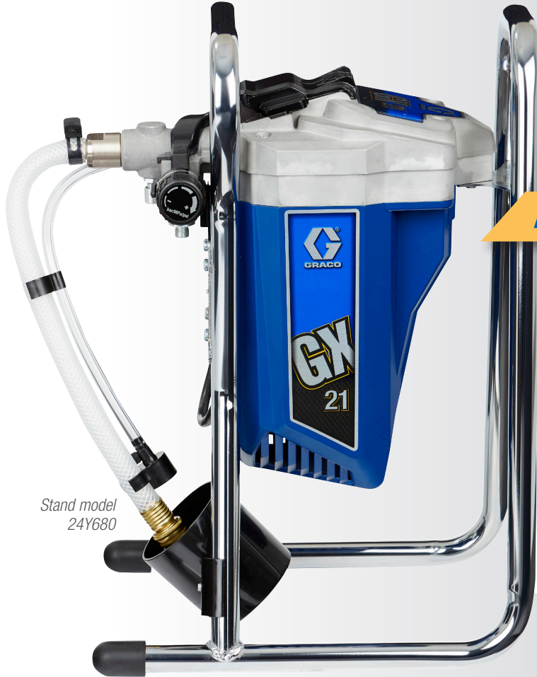
Stand model 24Y680