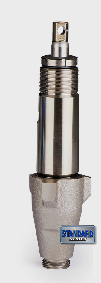
Endurance Chromex Pump for GH Lasts 2X longer than competing pumps

Graco's Standard Series sprayers deliver durability and performance for painting multiple projects a week, time after time.