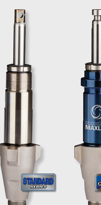
Endurance Chromex ™ Pump Lasts 2X longer than competing pumps