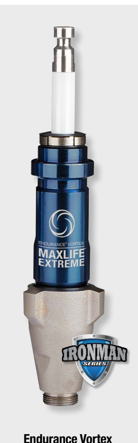
MaxLife Extreme Pump Extends pump rod life by 3X delivering the industry's lowest cost of ownership