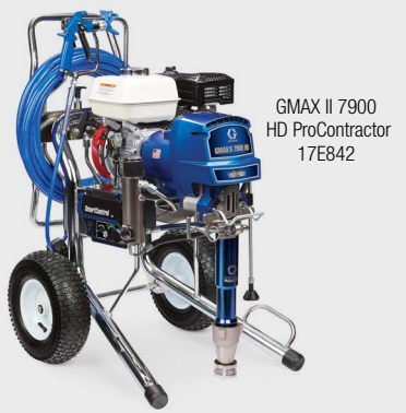
GMAX II HD