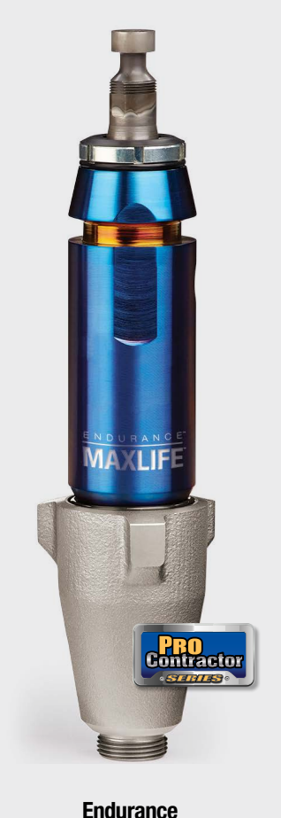
MaxLife Pump for GH 6X longer between repacks