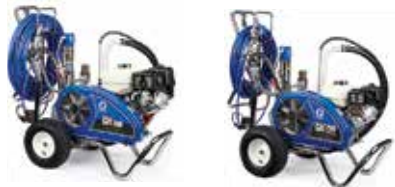
Ready to Spray: Complete with Spray Gun, 100' Blue Max II hose, and RAC X SwitchTip