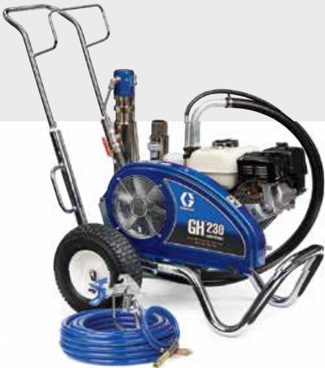
Ready to Spray: Complete with Spray Gun, 50' Blue Max II hose, and RAC X SwitchTip