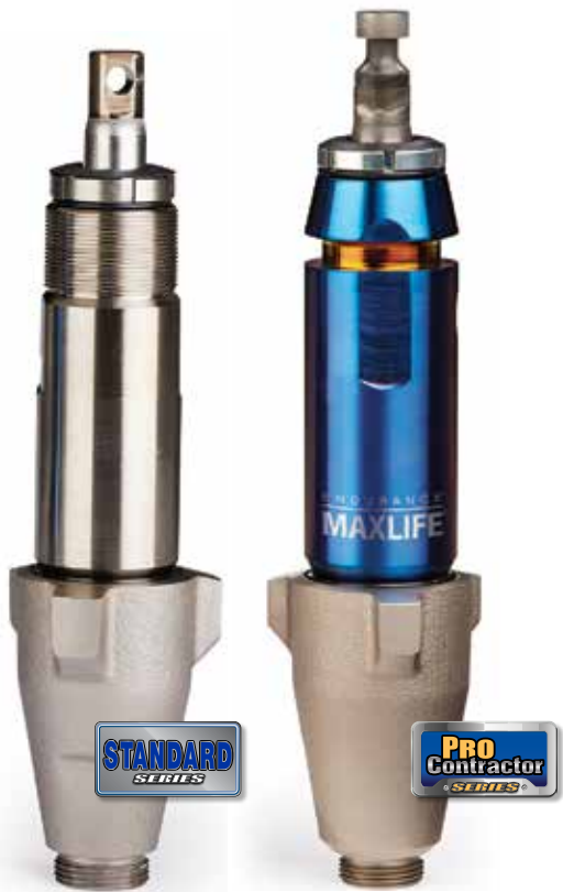
Endurance Chromex Pump for GH Lasts 1X longer than competing pumps