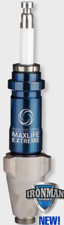
Endurance Vortex MaxLife Extreme Pump for GMAX Extends pump rod life by 3X—delivering the industry's lowest cost of ownership NEW!