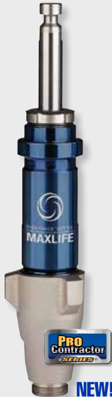
Endurance Vortex MaxLife Pump for GMAX 6X longer between repacks NEW!