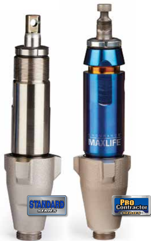
Endurance Chromex Pump for GH Lasts 2X longer than competing pumps