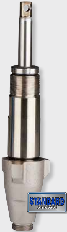
Endurance Chromex™ Pump for GMAX Lasts 2X longer than competing pumps