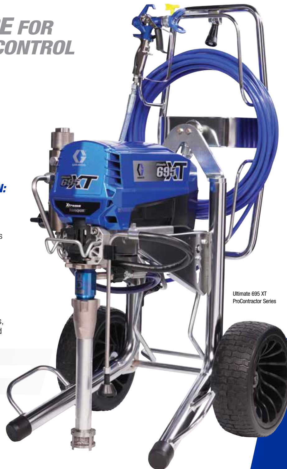
Ultimate 695 XT ProContractor Series