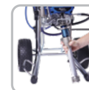
Open Door & Remove Pump