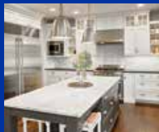
Finishing and Refinishing