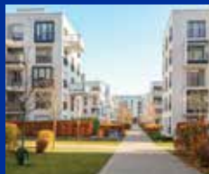
Maintenance and Remodeling