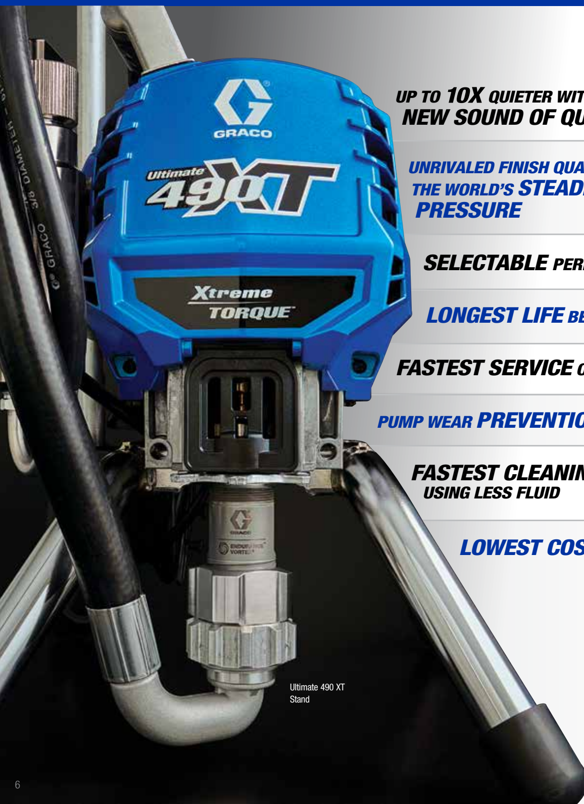
Ultimate 490 XT Stand

Intelligent auto-shutoff feature activates when the sprayer runs out of paint, safeguarding the pump and maintaining consistent performance.