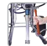
Loosen the Clamping Nut