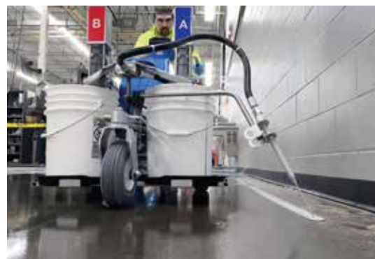
TAKE IT TO THE FLOOR!