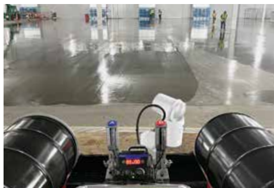
USE IT AS A STATIONARY MIX STATION

REMOTELY MIX UP TO 250 GALLONS PER CHARGE WITH ON-BOARD, HIGH-CAPACITY LITHIUM BATTERY