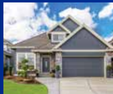
New Residential and Repaint