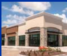
Commercial and Multifamily