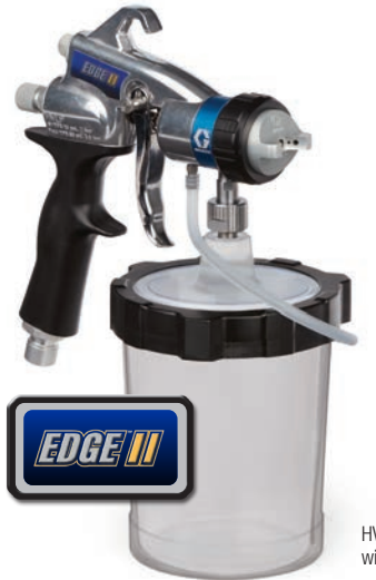
HVLP EDGE II Gun with FlexLiner — 17P481

Gain the competitive edge you need with the cutting-edge technology available only in the HVLP EDGE II and EDGE II PLUS guns.