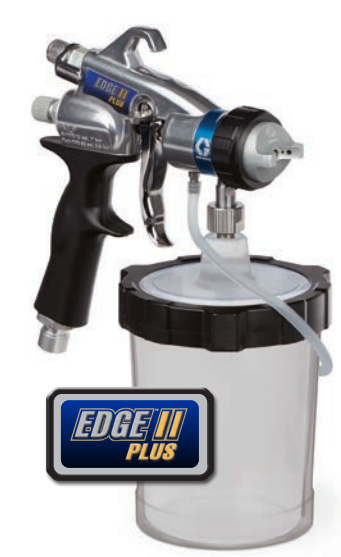
HVLP EDGE II Plus Gun with FlexLiner - 17P483