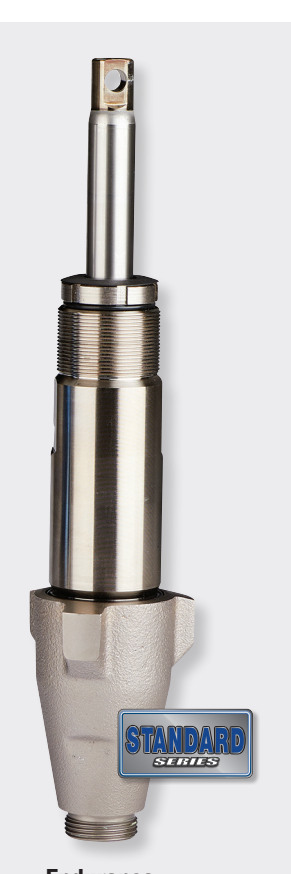
Endurance Chromex™ Pump Lasts 2X longer than competing pumps