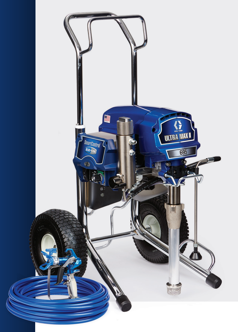
Ready to Spray: Complete with Contractor PC Spray Gun, 15 m Blue Max II hose, and RAC X SwitchTip