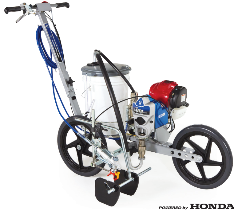
POWERED by HONDA

Introduced in 2004, the FieldLazer S100 set the standard for airless field marking and is now recognized by industry professionals as one of the top walk-behind field marking machines available.