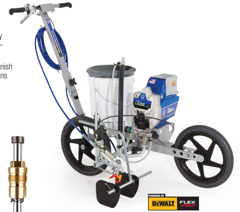
POWERED BY DEWALT FLEXVOLT