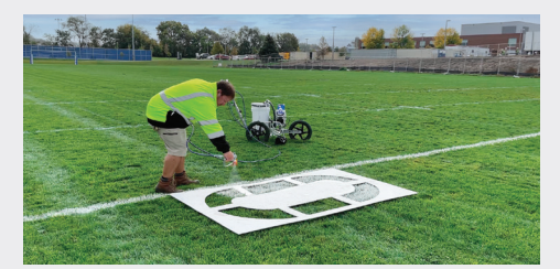
No-Tool Gun Removal for spraying stencils or large solid areas.