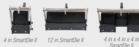
4 in SmartDie II 12 in SmartDie II 4 in x 4 in x 4 in SmartDie II