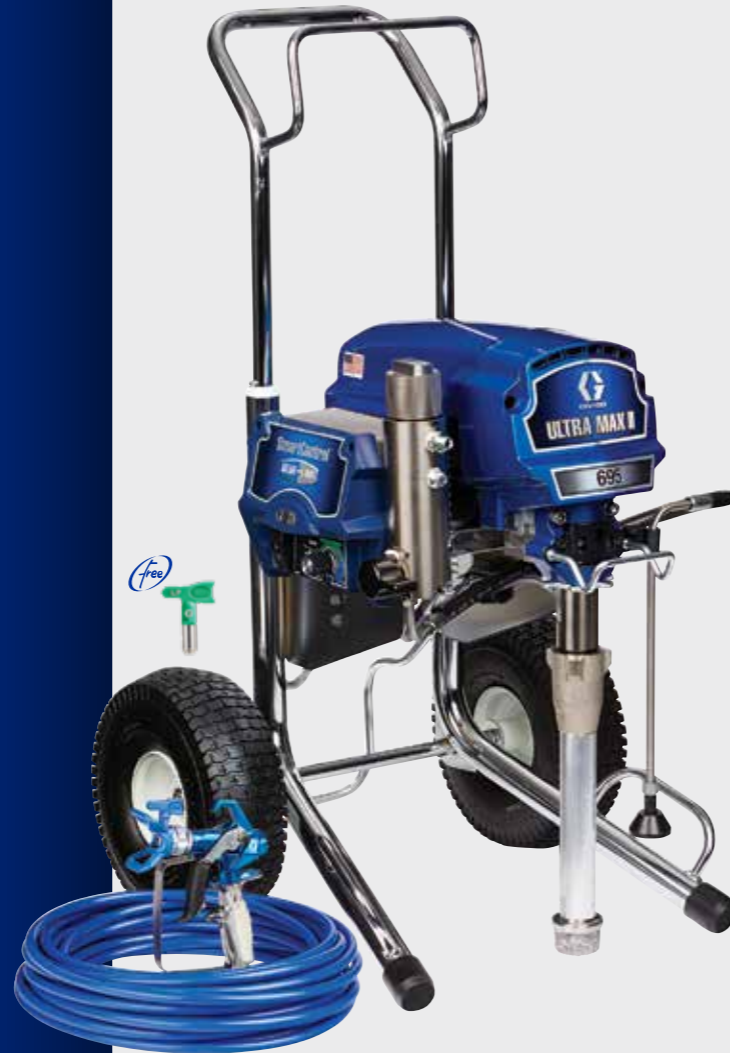
Ready to Spray: Complete with Contractor PC Spray Gun, 50 ft Blue Max II hose, and RAC X SwitchTip