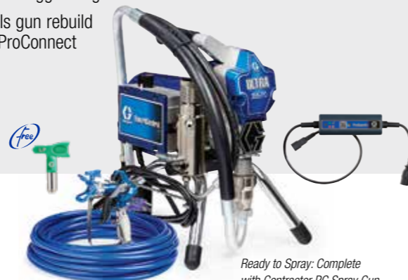
Ready to Spray: Complete with Contractor PC Spray Gun, 15m Blue Max™ II hose, and RAC X SwitchTip™