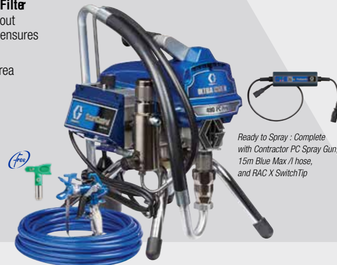
Ready to Spray: Complete with Contractor PC Spray Gun, 15m Blue Max™ II hose, and RAC X SwitchTip™