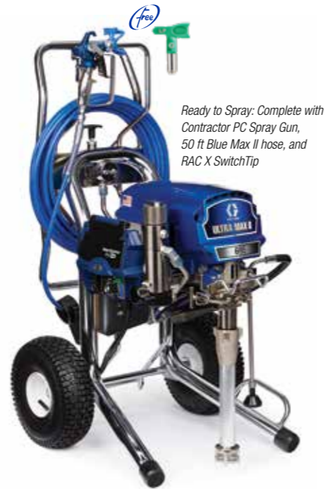
Ready to Spray: Complete with Contractor PC Spray Gun, 50 ft Blue Max II hose, and RAC X SwitchTip