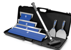
ProSurface Drywall Worker Set (18C676) shown

For More information visit graco.com/ProSurface