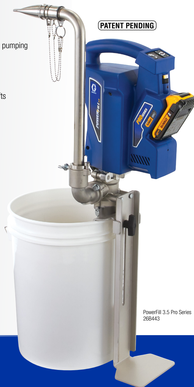
PowerFill 3.5 Pro Series 26B443