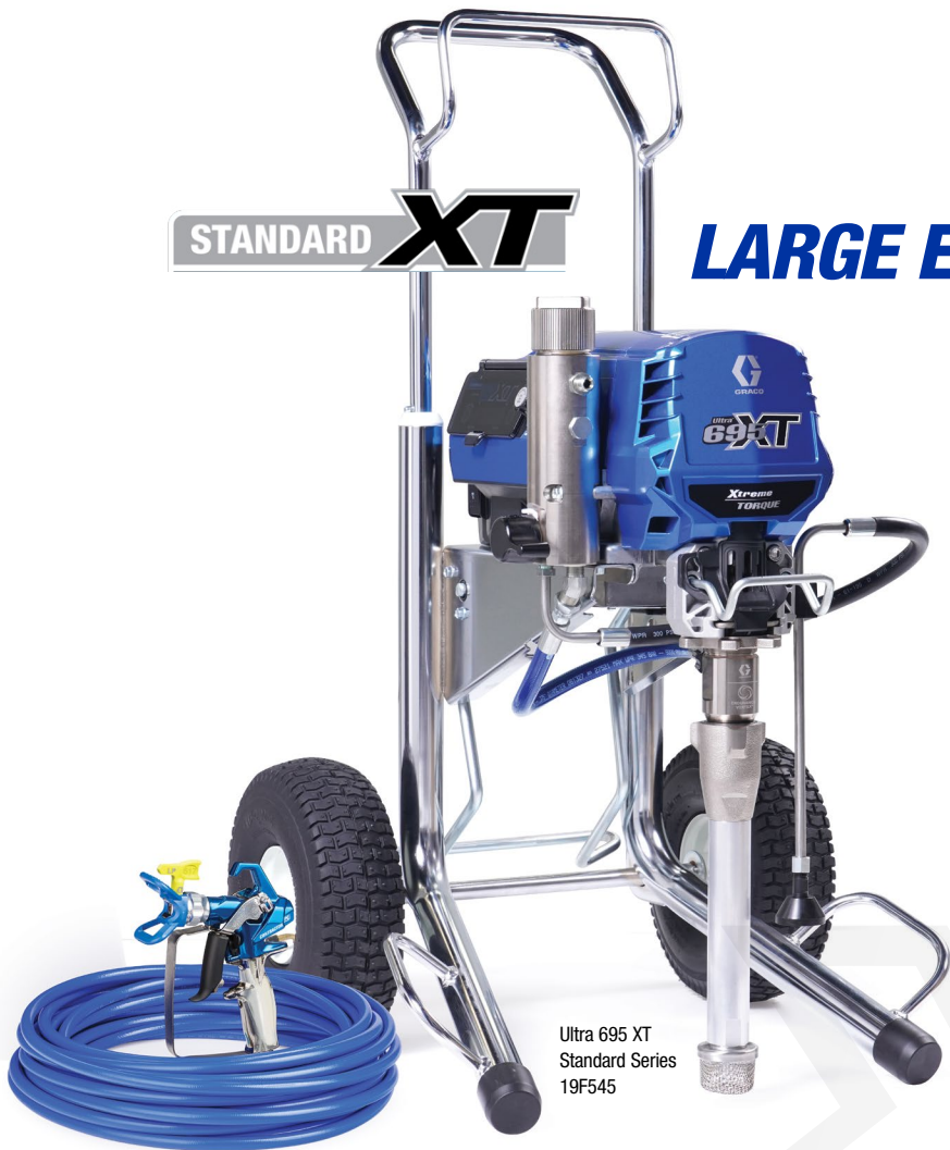
Ultra 695 XT Standard Series 19F545

Larger painting jobs demand the proven quality and performance of Graco's Standard Series large electric sprayers to deliver a job well done, every time.