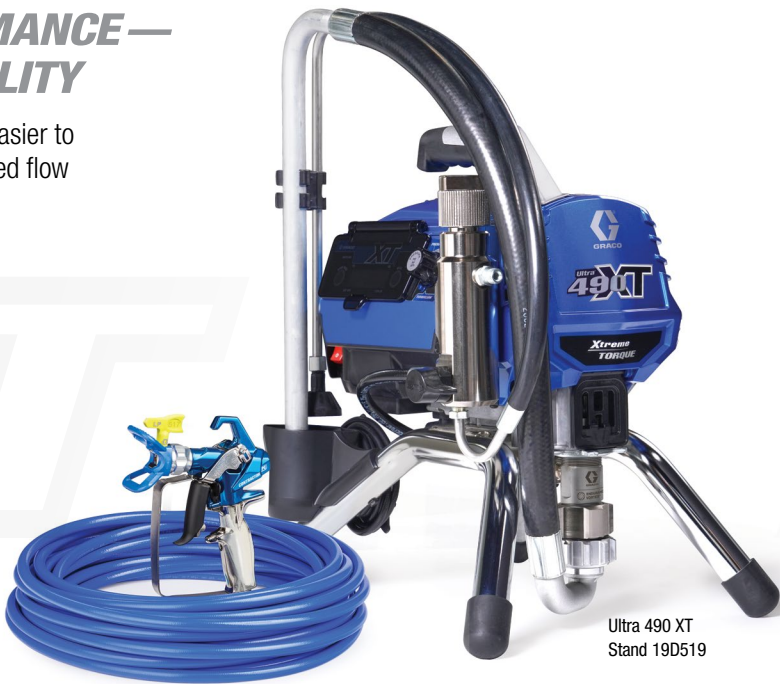
Ultra 490 XT Stand 19D519

Midsized electric airless sprayers make it easier to get more work done in a day with increased flow and production rates.