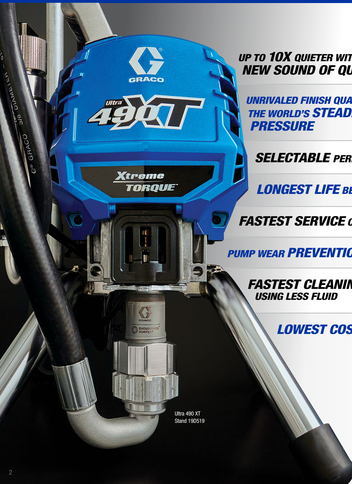
Ultra 490 XT Stand 19D519

Intelligent auto-shutoff feature activates when the sprayer runs out of paint, safeguarding the pump and maintaining consistent performance.