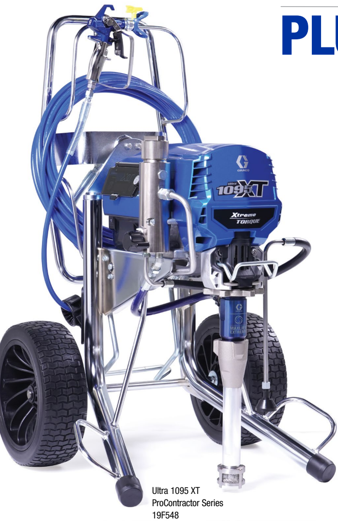
Ultra 1095 XT ProContractor Series 19F548