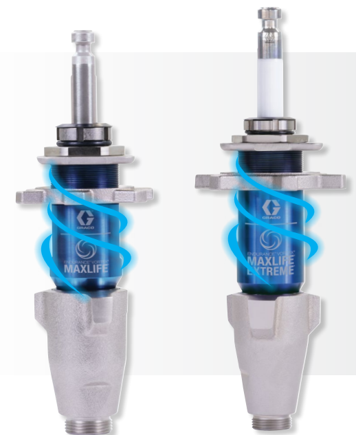
Endurance Vortex MaxLife Pump