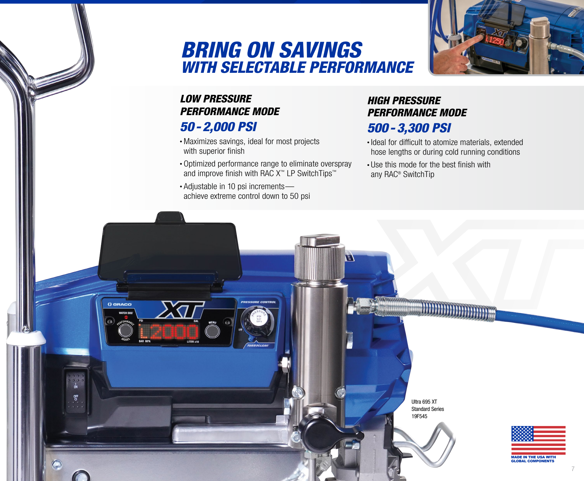
Ultra 695 XT Standard Series 19F545