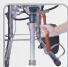
Loosen the Clamping Nut