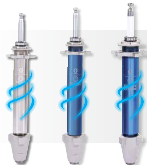
Endurance Chromex™ Pump Lasts 2X longer than competing pumps