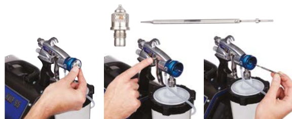
1. Remove front air cap and nozzle.