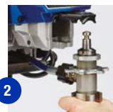
2 Open door and remove pump