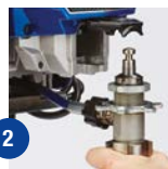
2 Open door and remove pump