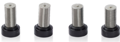
Fluid Filter Kits (100 Mesh Included in Gun)