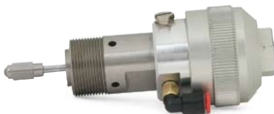
High Pressure Color Valve