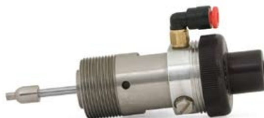
Low Pressure Color Valve